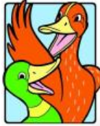
17 Quacking Ducks

Make your hand a puppet that says q instead of quack.